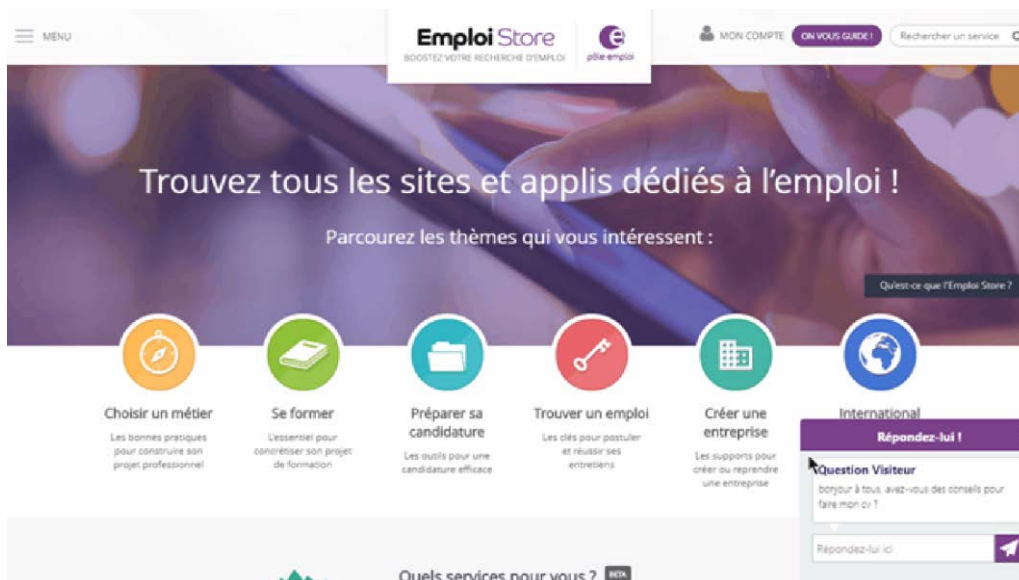
Figure 2: Applications used at Pôle Emploi.

Following a demonstration of “collective intelligence”, the decision was made to generalize a mutual aid support service and counseling tools on public (Internet) platforms. This arrangement (the pop-up in the bottom right corner of the screen capture in Figure 2) can be used to ask questions directly to other cybernauts in order to profit from the power of the “crowd”. It also: