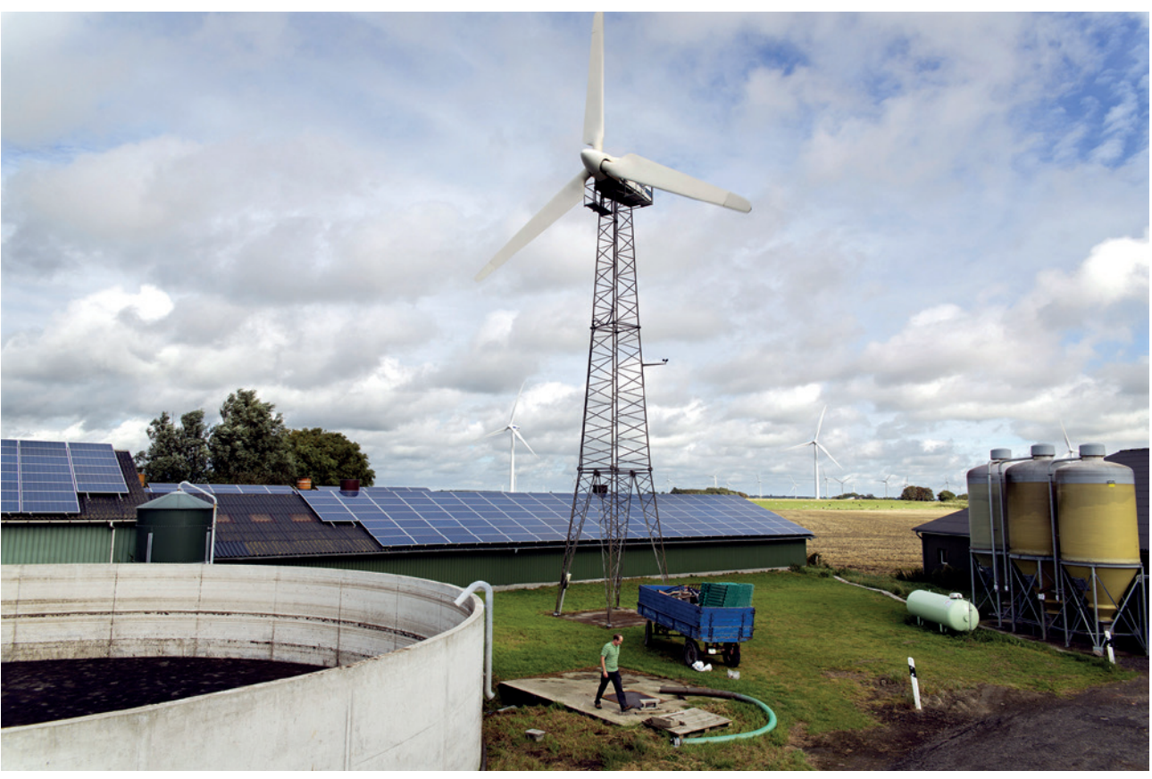
Family farm in Schleswig-Holstein with wind turbine and solar panels.

"Private citizens and farmers now own almost half of Germany's renewable energy installed capacity, while in Denmark, private individuals own 85% of its wind turbines."