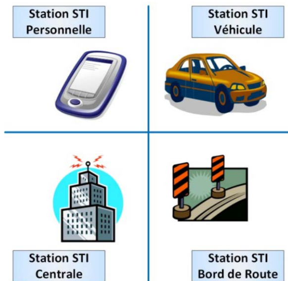
Figure 1: Different types of ITS stations

This technology comes with high economic stakes. Consequently, competition sometimes carries over into the process of standardization, which, by overseeing the interoperability of the equipment made by different firms, gives a boost to certain forms of technology. ITS solutions fall into one of two categories: proprietary solutions (which a firm adopts as part of its sales pitch to customers) and standardized solutions (which enable the market to grow and make manufacturers and service-providers compete). In the first case, the objective is to turn a product into a de facto standard so as to occupy a dominant position in the market. However standardization, when justified, is impartial with respect to the market's equilibrium and evolution. 5 It opens market doors to small and medium-sized businesses, allows for improving products and their compatibility, and thus produces economies of scale. For these reasons, standards should have a scope restricted to specifications for performance or interfaces so as not to clip the wings of invention.