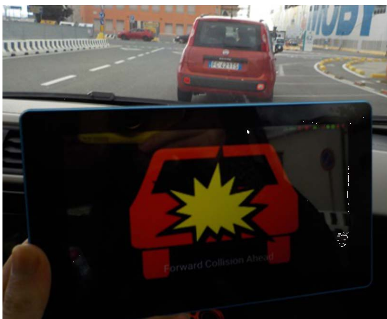
Figure 4: Warning: Risk of collision

A test campaign scheduled for 2019 is to concentrate on the interoperability of security procedures: certificates and anonymization of vehicles to avoid tracking.