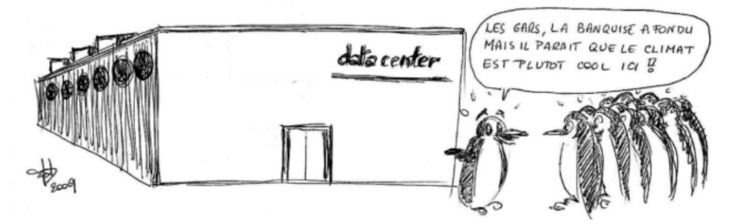
Figure 6: Data centers

Despite recent progress, most data centers are lagging; their design and technology falls far behind the state of the art. Rules and standards have been proposed to improve the design and operation of these centers, primarily so that they waste less energy.