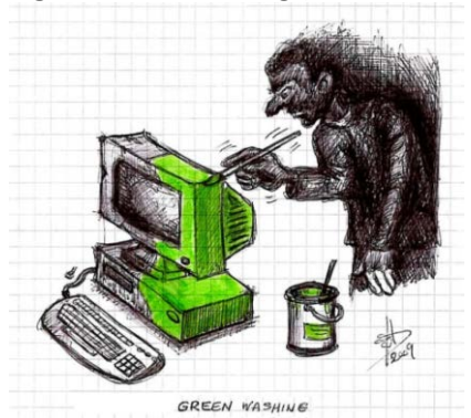
Figure 3: Eco-labeling

Better managing the product life cycle has implications for consumption. "The ecolabeling of products of mass consumption is a procedure decided by the 'Grenelle of the Environment' [a meeting in 2007 of French officials and organizations for a wide-ranging discussion of environmental issues] in order to make consumers aware of the environmental impact of products."<sup>8</sup> The wide variety of ICT products, along with the complexity and transformation of production chains, has made ecolabeling even more complicated. At present, there are only three categories of products of the type "material/equipment (consumer of energy)" for which ADEME (the French Agency for the Environment and Energy Management) has validated the specifications: television sets, reused laser cartridges and telephones. Ecolabels are intended to improve communication and information about products in relation to the environment.