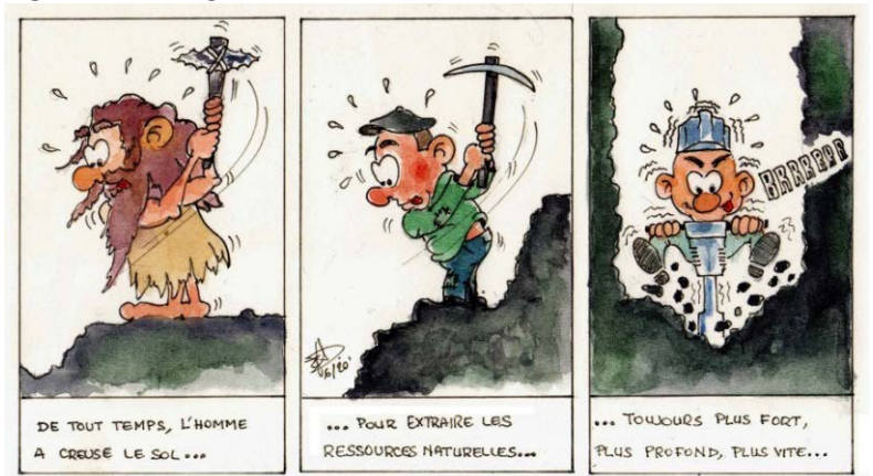
Figure 7: Mining

The Dodd-Frank Wall Street Reform and Consumer Protection Act was adopted in 2010 under the Obama administration. Though primarily intended to reform the financial sector by making it more accountable and transparent, this law also contains provisions (Title XV) about "disclosures on conflict materials in or near the Democratic Republic of the Congo". Corporations have to exercise "due diligence" in controlling their logistics and submit a public report to the Security and Exchange Commission (SEC) if their products are likely to contain blood-stained minerals. The objective is to see whether their purchases abet armed groups and to take the appropriate measures.